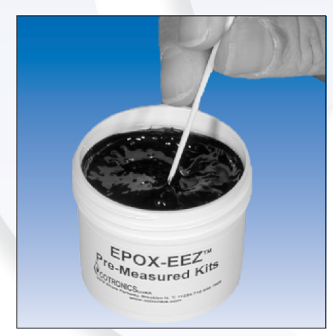
Mixing Epoxy Before Dispensing