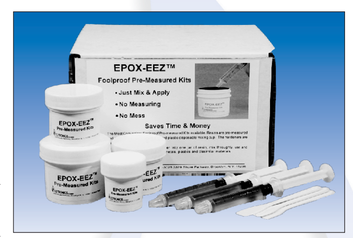
Packaged in Boxes of 10 Units